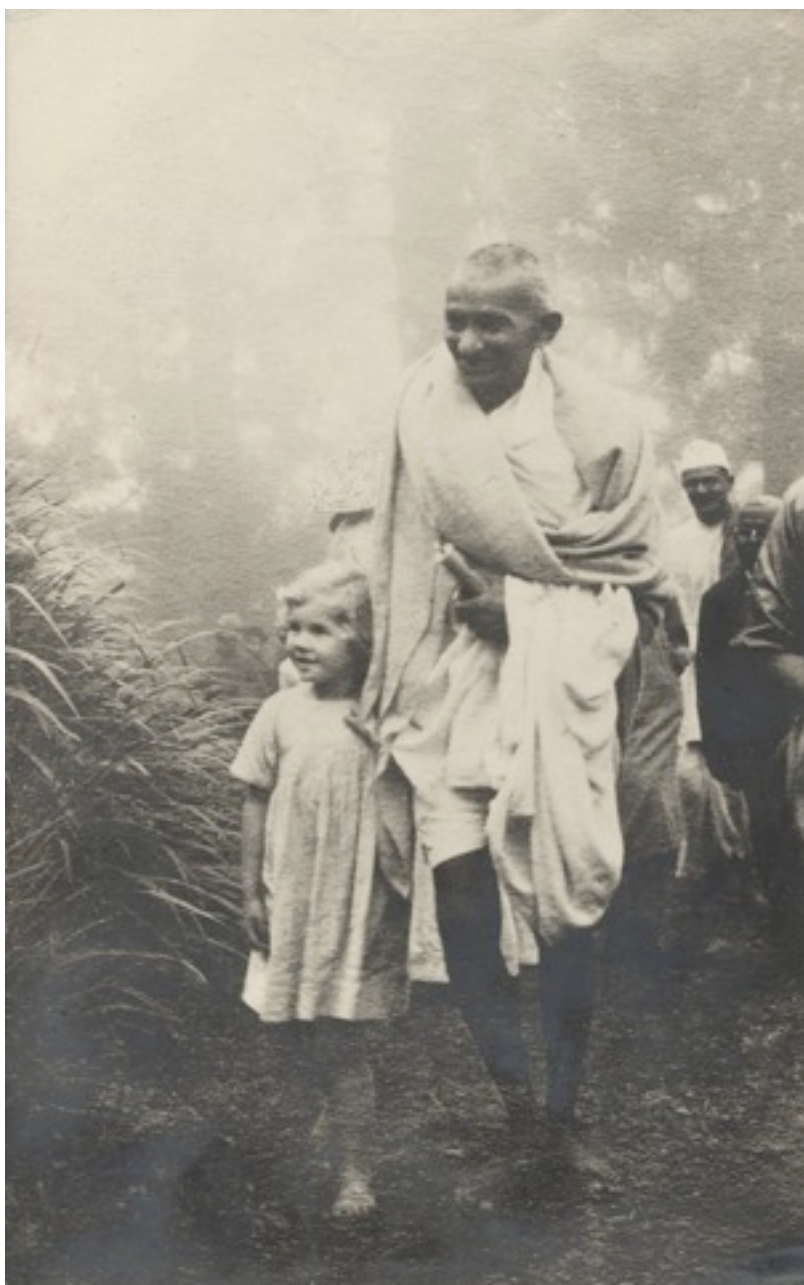
Gandhi and a young friend