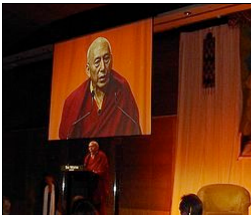
Professor Samdhong Rinpoche, Tibetan Prime Minister in exile.