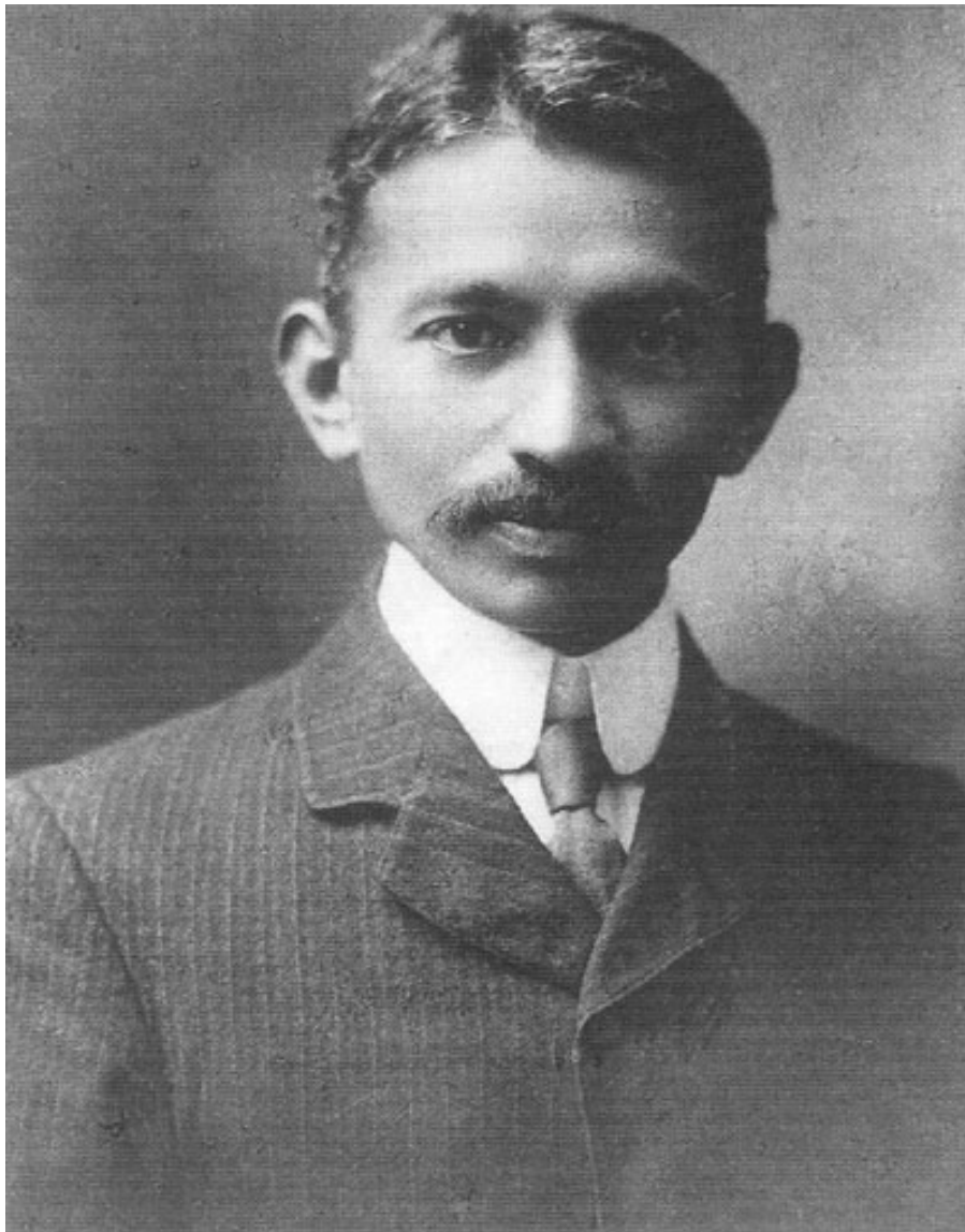
Gandhi in 1909 (Wikimedia Commons)