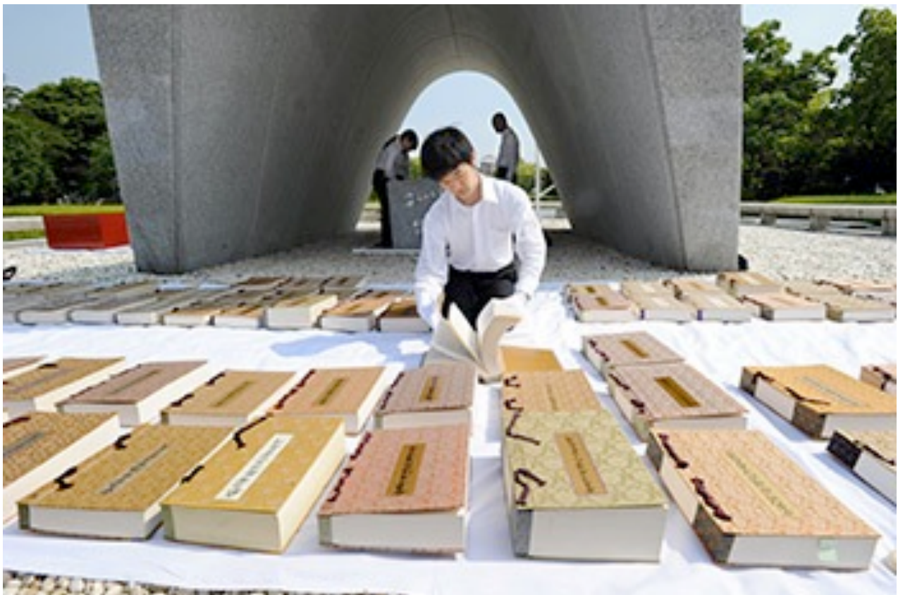
Airing books containing the names of atomic bomb victims of Hiroshima and Nagasaki at the Hiroshima Peace Memorial Park

Arnold Toynbee writes (in his autobiography, Experiences ) that he had been jolted out of the traditional accepting attitude to war by the slaughter of half of his friends in World War I. The same revulsion against war was widespread in its aftermath. He noted that such revulsion "ought [to] have been total and universal from the moment . . . the world entered the Atomic Age." He found that the American people, victorious in two world wars, had succumbed instead to militarism. Toynbee wrote this during the Vietnam War. Since then, the trauma of that war has been overshadowed by the events of 9/11, and militarism has become even more pervasive in American society.