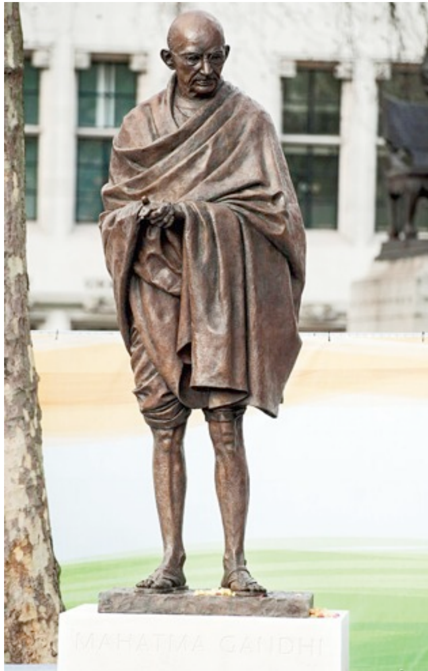
Statue of Gandhi in Parliament Square